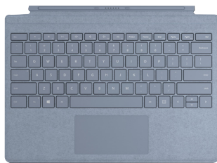
Surface Go Type Cover

Pair the Surface Go 3 with these accessories: